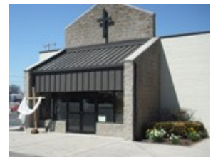
St. Teresa's Catholic Church, the location of the Service and Stewardship Kappa Session.

associate members were very respectful and hard working while serving those in need, which served as a great reminder to the active brothers that we have six great guys in our associate members.