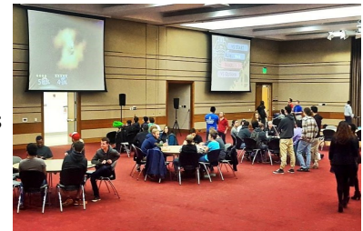
The Harre Union Ballrooms during "Smash Cancer."

Super Smash Brothers tournament. All of the participants, Associate Members, and brothers involved had fun, while managing to raise $200 for St. Baldrick's Childhood Cancer Foundation.